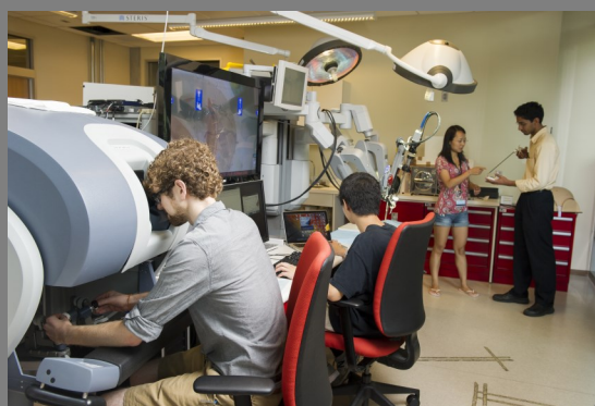
Graduate Students in LCSR.