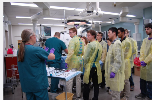
Research Experience for Undergraduates Program

True to its mission of creating knowledge and fostering innovation, LCSR is broadening its reach with several community and education programs. LCSR has been committed to Science, Technology, Engineering, and Math (STEM) outreach to the K-12 group as well as college-age students. The core of LCSR's outreach programs include the National Science Foundation funded Computational Sensing and Medical Robotics Research Experience for Undergraduates (CSMR REU) program, the annual Johns Hopkins Robo Challenge, and regular hands-on lab tours for students from various age groups. The REU program has been organized every summer for over a decade. Students from various universities across the United States spend 10-weeks in LCSR working on cutting-edge research projects and interacting closely with faculty mentors and graduate students. Over 60% of the participants in this program have gone on to graduate programs in a STEM field or Medical School. Close to 25% of program participants have been from underrepresented minority groups.