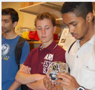
Tours for Students