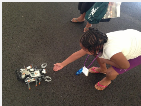
STEM Nation-African American Festival